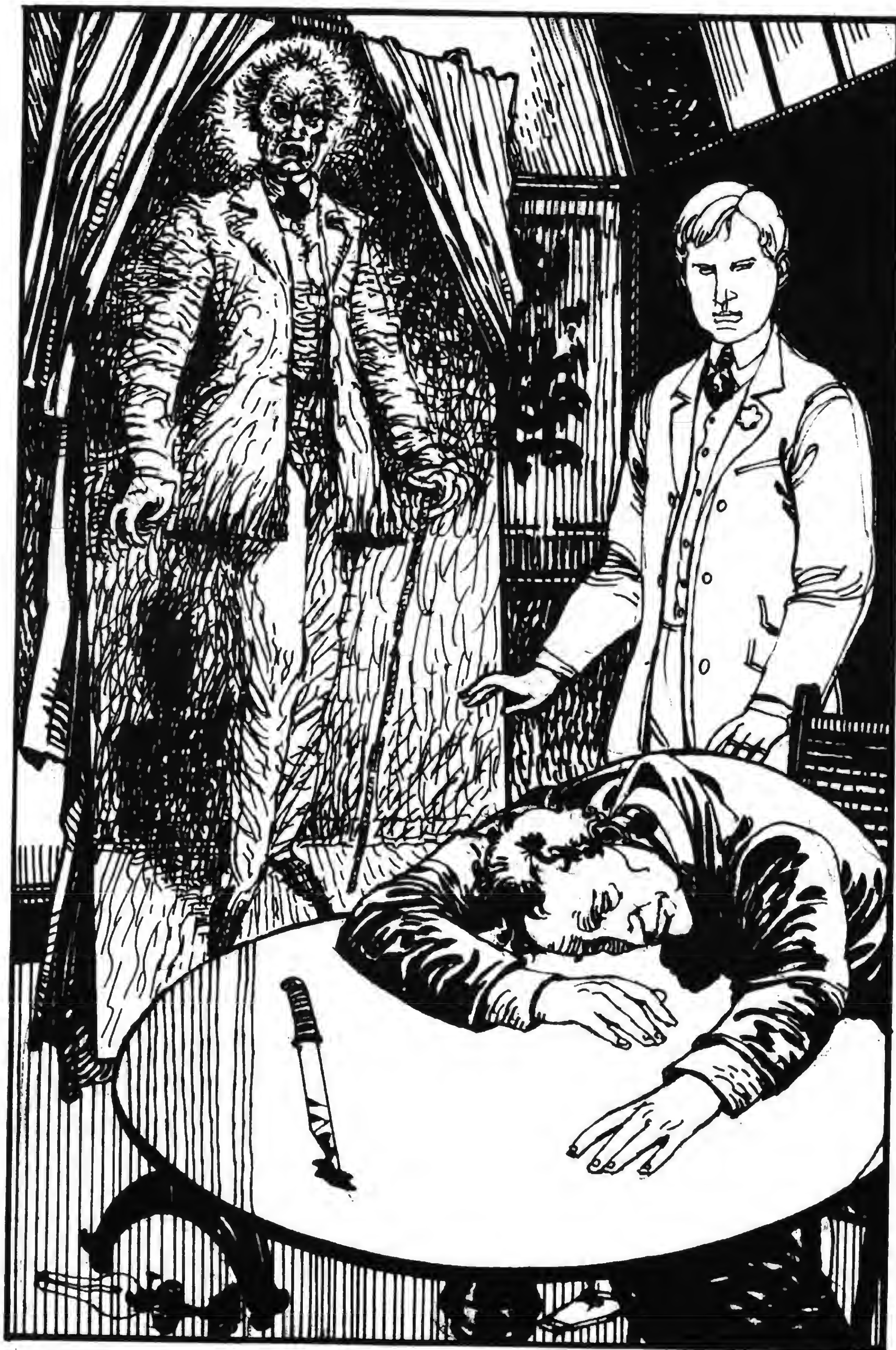
Dorian threw the knife down on the table and stood back. He could hear nothing but the sound of blood falling on to the carpet.

He threw the knife down on the table and stood back. He could hear nothing but the sound of blood falling on to the carpet. He opened the door and went out on to the stairs. The house was completely quiet. No one was there.